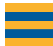
OLD RUTS RUGBY