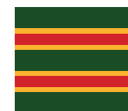
OLD WIMBLEDONIAN WARRIORS RFC