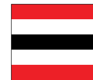
HAMMERSMITH & FULHAM RFC